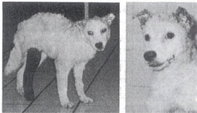
Cain suffered burns around the head and body as well as a broken leg