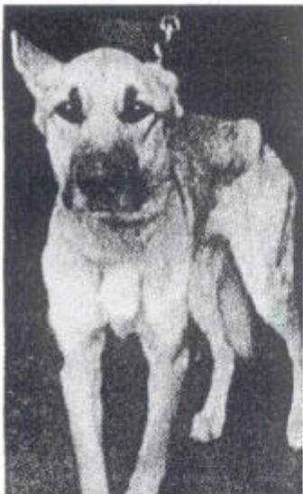
Left: A prime example of a dog given away "free to a good home".

The Society received a cruelty complaint concerning an emaciated dog kept in a Newark backyard under appalling conditions. An Animal Control Officer went to the scene and found a starving dog, without shelter, in a garbage-strewn yard, no area to walk, no bowl for water, no bowl for food...no one home who was concerned. The Society's Animal Control Officer confiscated the dog leaving a note who to contact for further information. No one ever called & we were unable to obtain the name of the person who would claim the dog as theirs. But the Society found a Verona, N. J. license and obtained the name and address of the licensee.