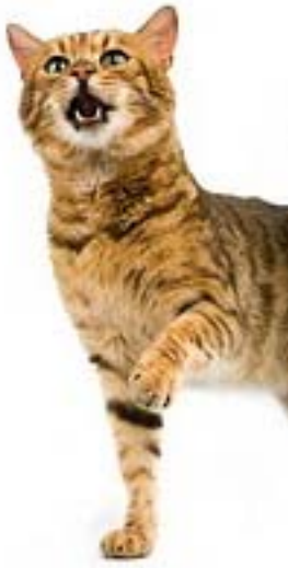
Me! Me! I Need a Leg Up!

Project TNR is currently developing a BRAND NEW program designed to assist TNR groups in becoming more effective and self sufficient. We are seeking to work with just ONE interested group for 2012 for this specialized mentoring program.